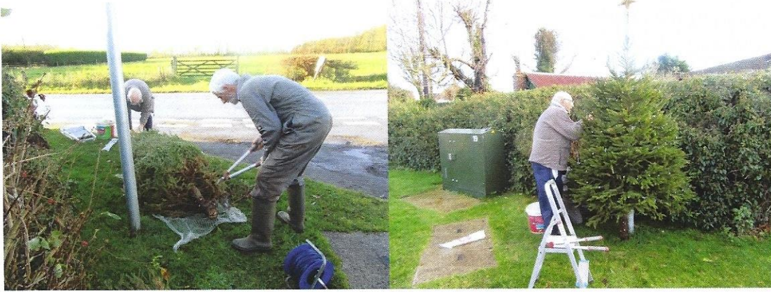
Putting up the Christmas tree

The Jubilee Committee would like to thank all residents who help to keep our village such a lovely place to live, and especially those who helped out during the autumn when one of our key men was taken poorly and was unable to maintain the public areas for a couple months. Hopefully a near normal service will resume next year with the possibility that the Parish Council will takeover at least some, if not all, of the grass cutting. The Parish Council will also be stripping down the bench adjacent to the Chapel and repainting it. They will also be applying a wood preservative to the War Memorial Gates.